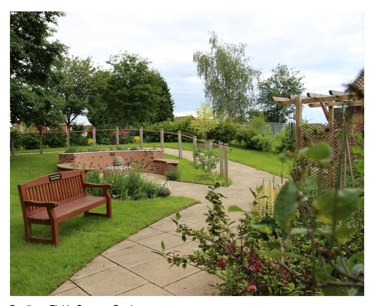
Bradbury Fields Sensory Gardens

Bradbury Fields is a registered Charity No. 222798. By booking your wedding or special celebratory event with us you are directly supporting our work with local blind and partially sighted people.