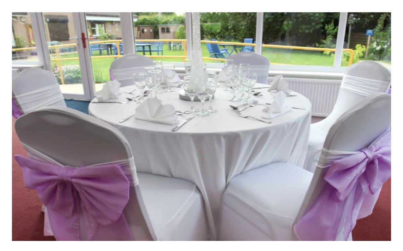
Iris Conservatory Special Occasion Dining