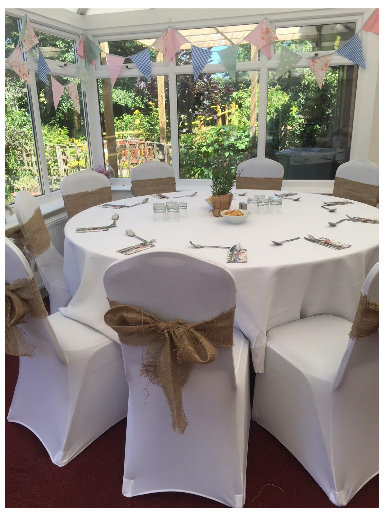
Rustic tie backs can be added to our banqueting chairs for a Country Living look.