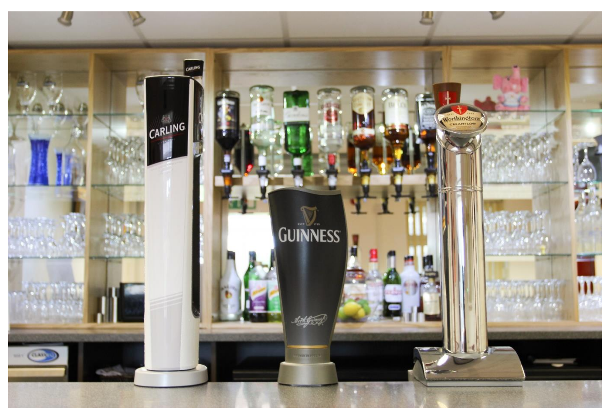
Kennels – our fully licensed bar.