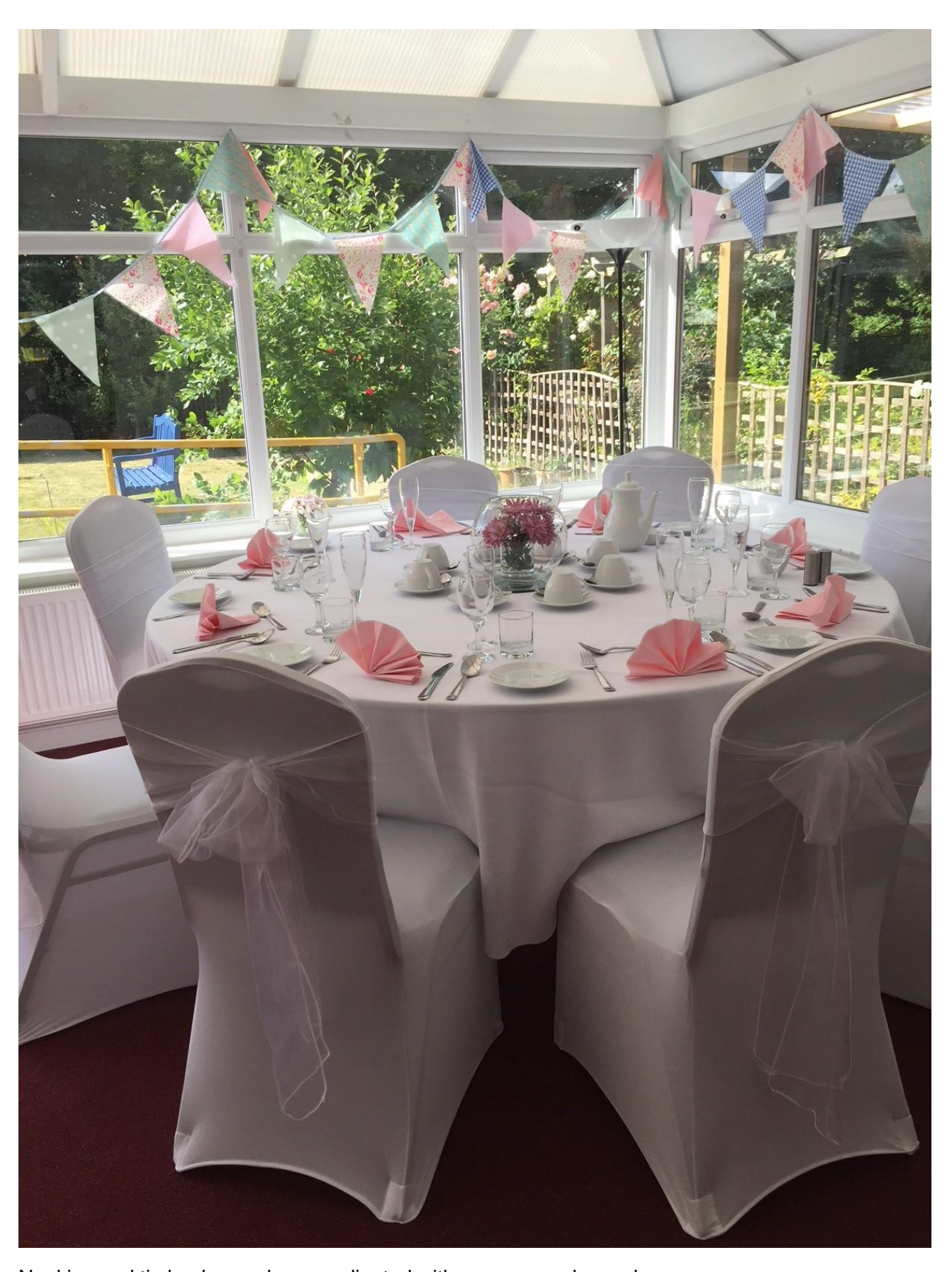
Napkins and tie backs can be co-ordinated with your own colour scheme.